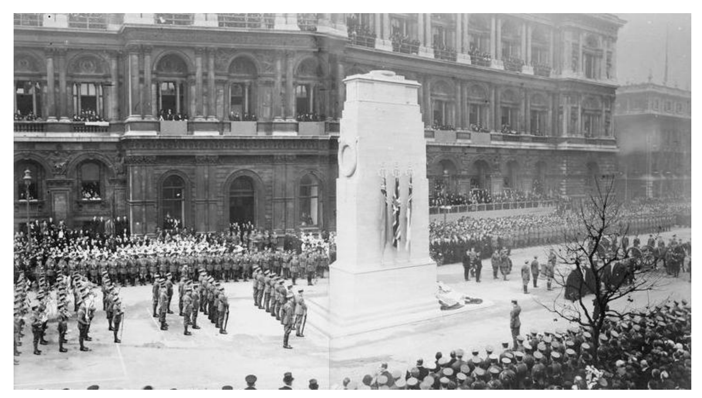
The Massed Bands, seen on the left of the photograph, in position at the Cenotaph towards the end of the service. The Firing Party is in front of the band; the Gun Carriage is on the extreme right of the picture

The service over, the massed bands counter-marched and, led by the firing party, marched along Parliament Street via the north and west sides of Parliament Square towards the North Door of Westminster Abbey. Behind the bands walked the Archbishop of Canterbury and the heads of various religious denominations, then came the gun carriage, behind which marched The King and Royal Princes, followed by the Mourners.