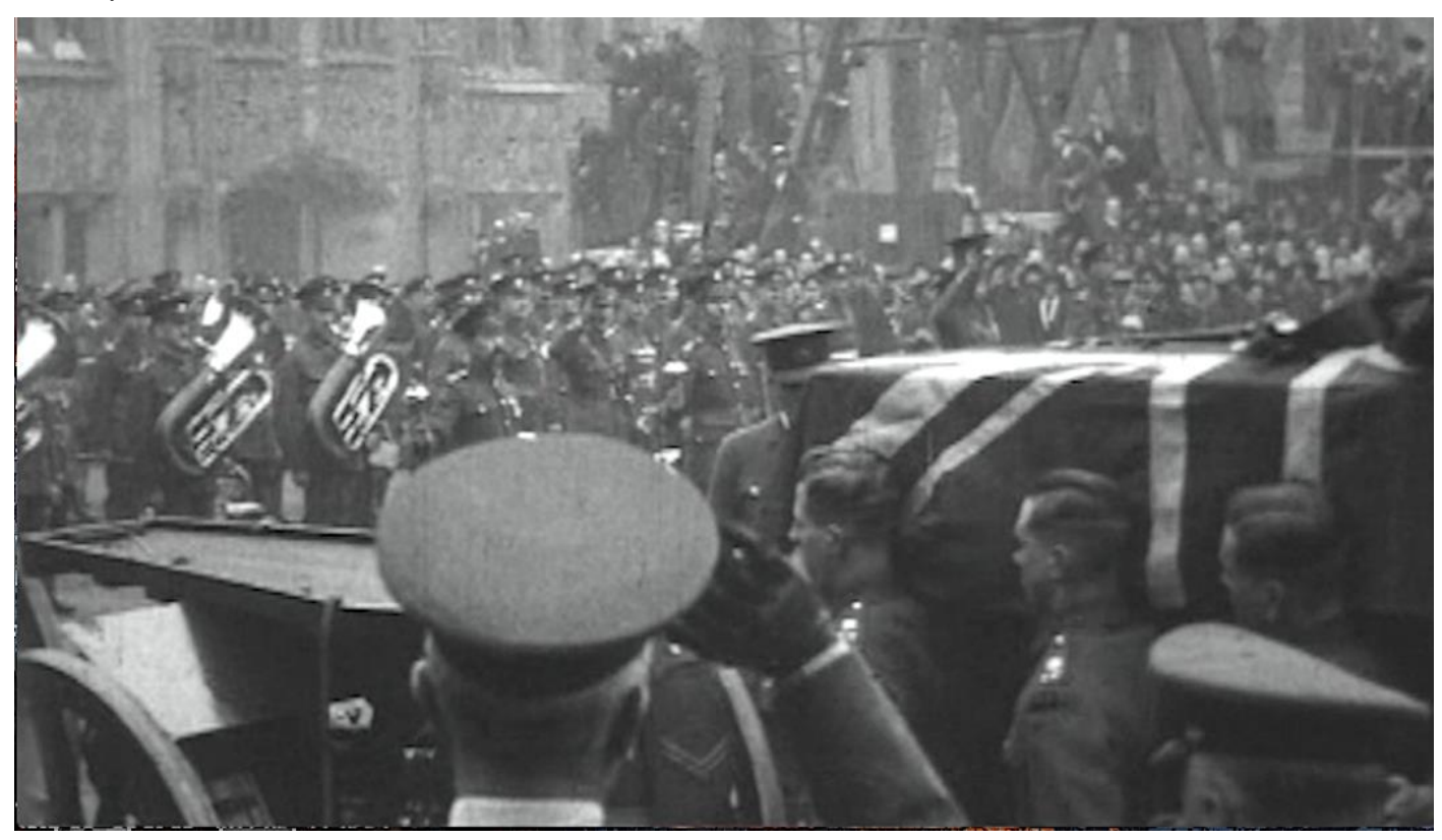
The Massed Bands in Broad Sanctuary as the coffin of the Unknown Warrior is removed from the Gun Carriage to be carried into Westminster Abbey

The firing party passed through the gate in the iron railings and marched towards the Abbey's North Door, opening out to 6 paces between ranks, halting and turning inwards to rest on their arms reversed. The massed bands had continued along Broad Sanctuary, countermarched and halted.